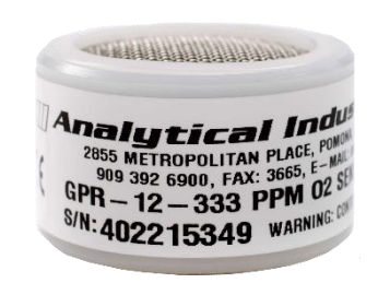
Exhibit excellent stability at low PPM oxygen levels, faster recovery from excursions to high oxygen concentrations and a longer service life than traditional sensors.